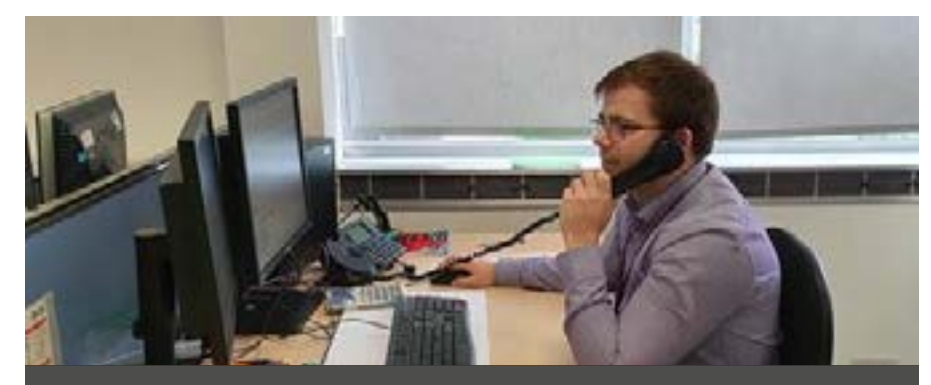
Our Revenues & Benefits and Housing teams are manning the helplines to support you if you're worried about paying Council Tax or need advice on Benefits or rent issues.

In addition, if you live in a council-owned property and are concerned about paying rent please contact our housing team on 01962 848 205 .