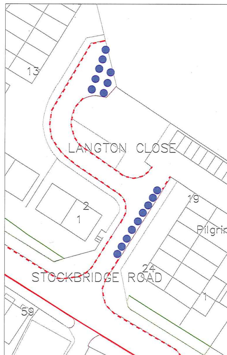
PROPOSED WAITING RESTRICTIONS