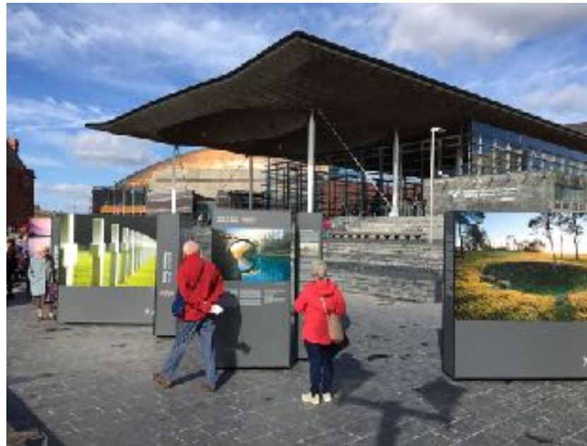
Cardiff - Welsh National Assembly