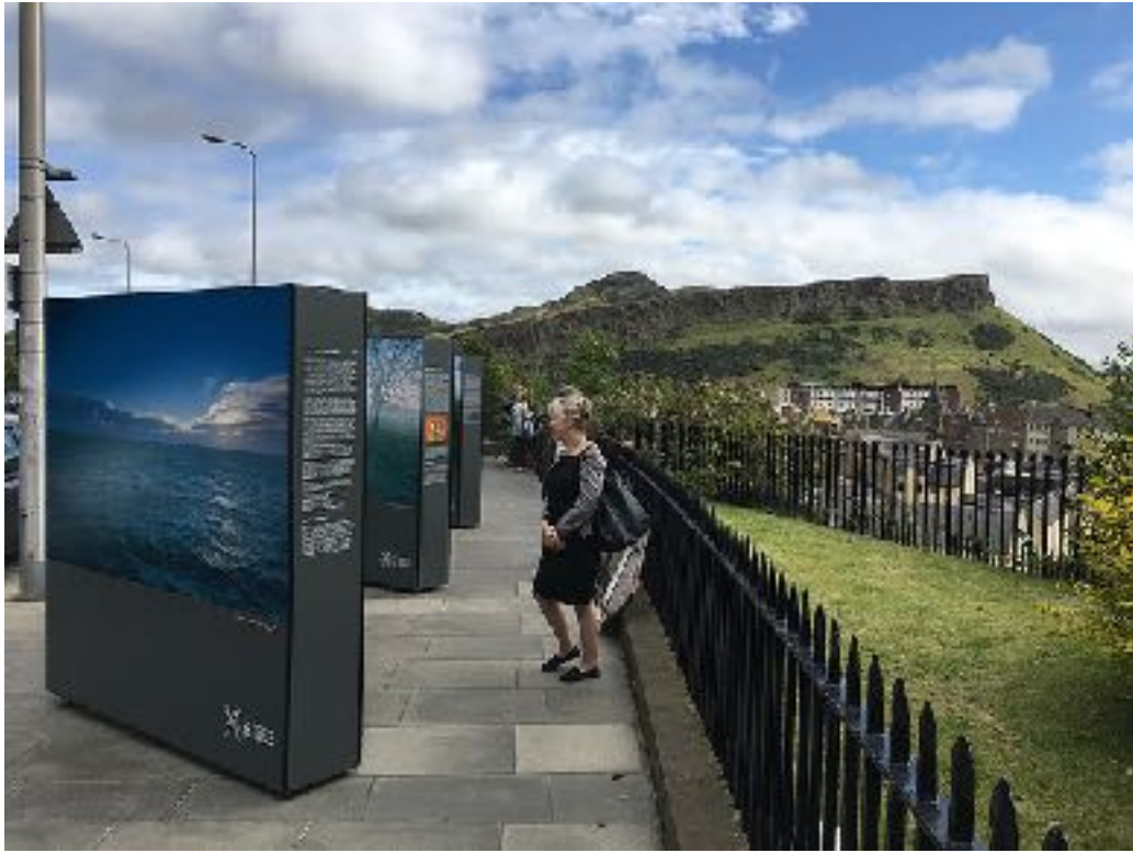
Edinburgh - Arthur's Seat in the background