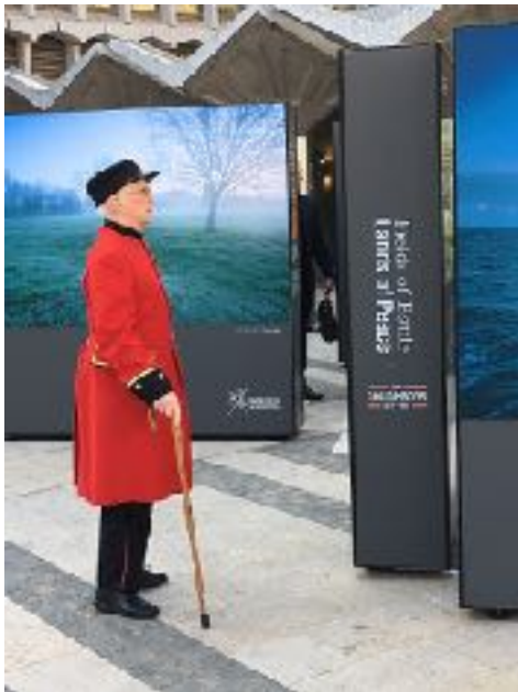
City of London - The Guildhall