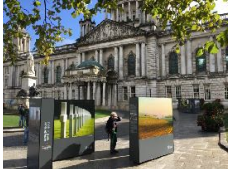
Belfast City Hall