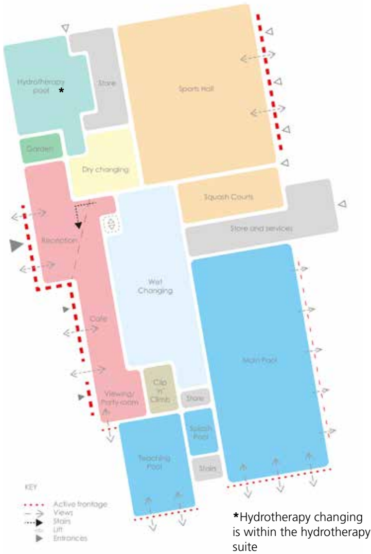
GROUND FLOOR PLAN LAYOUT