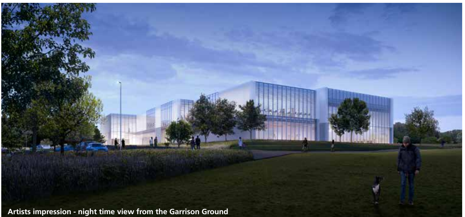
Artists impression - night time view from the Garrison Ground