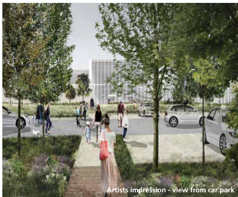
Artists impression - view from car park