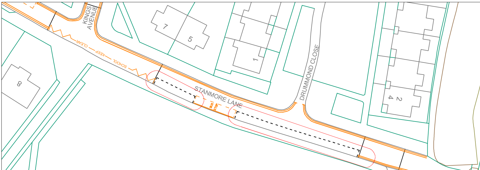
PROPOSED PARKING BAY RESTRICTIONS - 2 HOURS LIMITED WAITING MON-FRI 10AM-4PM