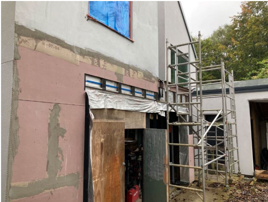
Stratton: Northern elevation as built