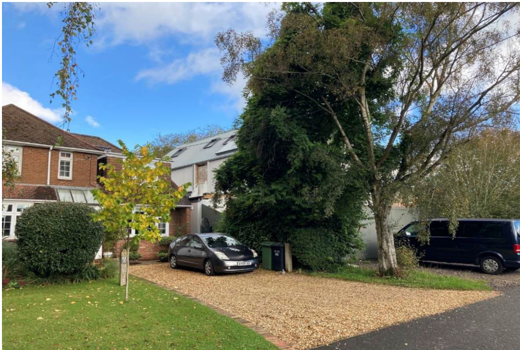
Stratton: South West elevation as built

3.4 On the 2 nd of October the applicant's agent Mr Welch was contacted by Winchester City Council's enforcement team who alleged that the building was not built in accordance with the earlier application (08/01823/FUL) and requested that the breach be regularised through the submission of an application or by " removing the unauthorised development ". A copy of this request by e-mail is attached as Appendix 2.