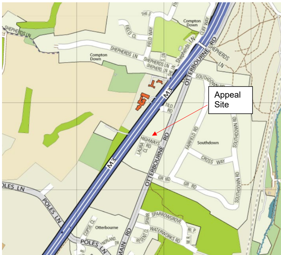
Ordnance Survey map data by permission of Ordnance Survey, © Crown copyright

2.2 The map below shows the location of the site.