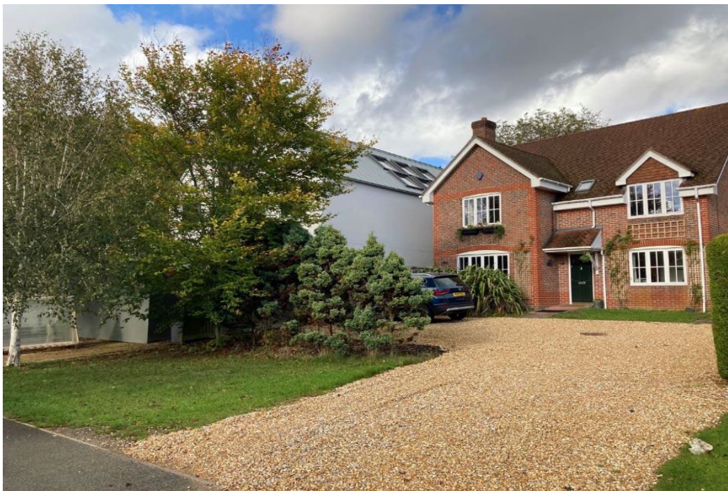
Stratton: South East elevation as built