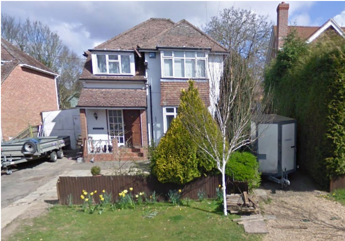
Stratton: The original 1920's dwelling (South Elevation)