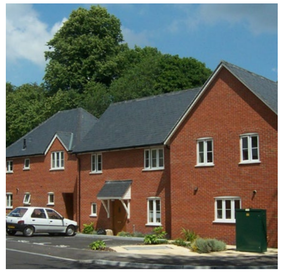
Affordable housing, Itchen Abbas

The need for affordable housing and shared ownership options is supported by stakeholder feedback that homes to buy or rent are too expensive for local people on average or below average wages to afford to buy or rent. This is particularly relevant to those aged 40 and below for purchasing and for all ages seeking rented accommodation. Stake holder feedback included Registered Providers and letting agent feedback on current activity and performance of the housing market.