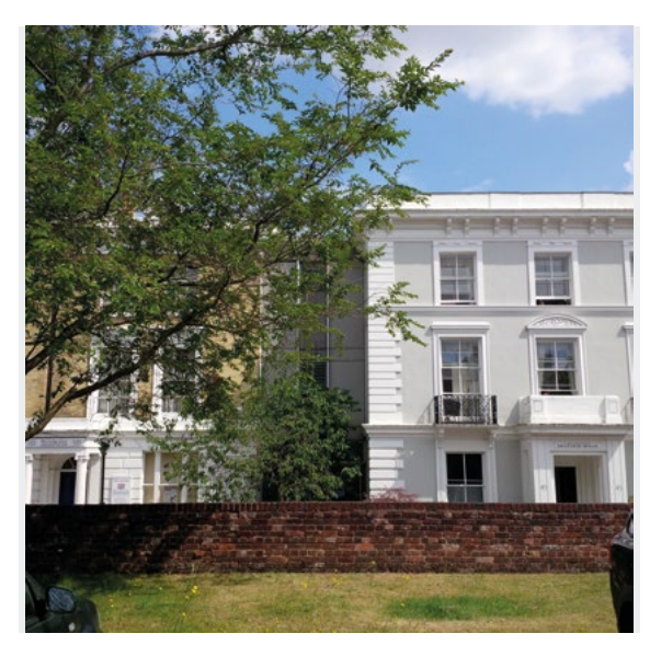
Modern housing in keeping of the area