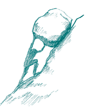
"Pushing a rock up a hill - if we can just get that one, big, transformational investment done, it will change everything for us all."

"Consultation fatigue arises from how impersonal we feel it is. How well are we being listened to?"