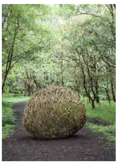
Inside Lane Lenzie, Scotland, UK

Organised by 'Art Walk Projects', this event continues over a 2 month period, introducing people to and highlighting the qualities of lost, disconnected and hidden areas of Lenzie.